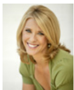
Tracey Spicer Journalist, newsreader and TV personality